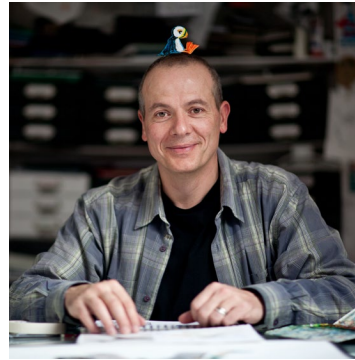
Petr Horáček Author & Illustrator