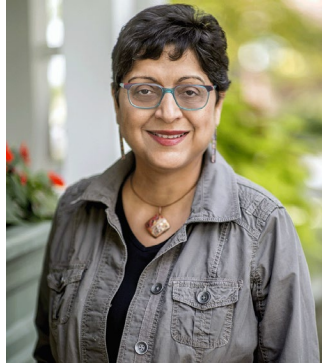
Thrity Umrigar Author